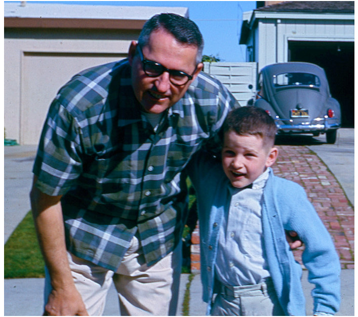
Father John and his Dad circa 1965

This is not to deny the reality of our obligations; nor is it to suggest that we should seek escape from the world as a way to find God—though, perhaps, sometimes, such an escape is needed. But, if the Incarnation teaches us anything, it teaches us that salvation is found, primarily, in the day-to-day crosses and resurrections of our world. Christ comes to us not only in the moments of obvious holiness—in the celebration of the Eucharist, or in quiet moments of contemplation—but in the marketplace and