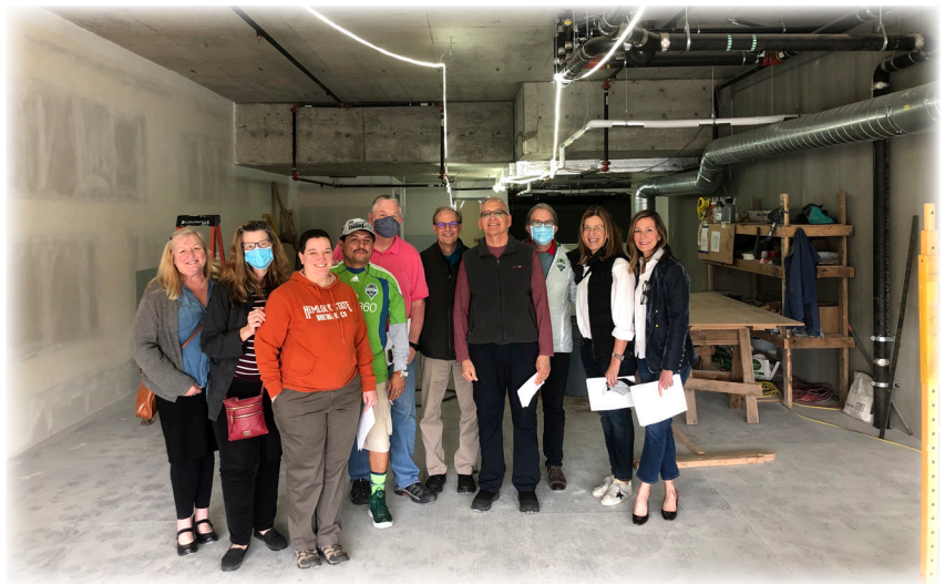
Parish Staff and Volunteers Tour the New Space