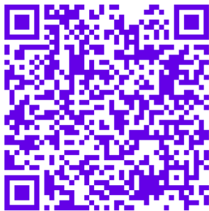
Facing Homelessness Amazon Wish List

There are lots of ways to help! You can sign up to have a meal delivered through meal train , drop off sandwiches and other items at the church (scan the QR code or click here to sign up ) or buy directly from their Amazon Wish List!