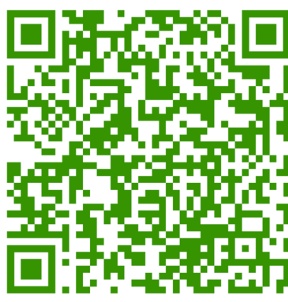
Facing Homelessness Food Donation