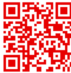
Facing Homelessness Meal Train