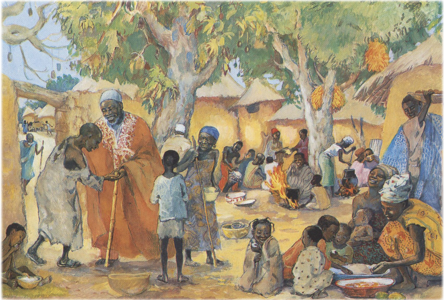
JESUS MAFA. Luke 13: 28-30 - The poor invited to the feast , from Art in the Christian Tradition , a project of the Vanderbilt Divinity Library, Nashville, TN.

Sunday, August 21, 2022 * Twenty First Sunday in Ordinary Time * www.stjosephparish.org