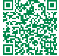
Immigration Summit Action

TAKE ACTION: On August 9, the Afghan Adjustment Act was introduced to Congress. While Congress is currently on recess, we are encouraging you to reach out to representative and senators, urging them to support the passage of Afghan Adjustment Act. You can take action here. Please spread the word within your community!