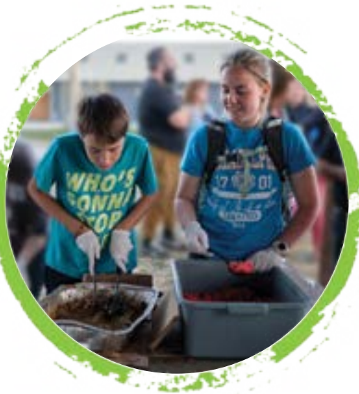
PICTURED: Youth giving back