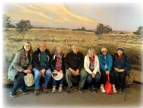
The Seniors Group had a wonderful outing to the Woodland Park Zoo last month!