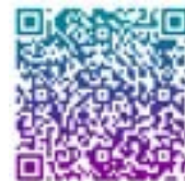
Amazon Wish List