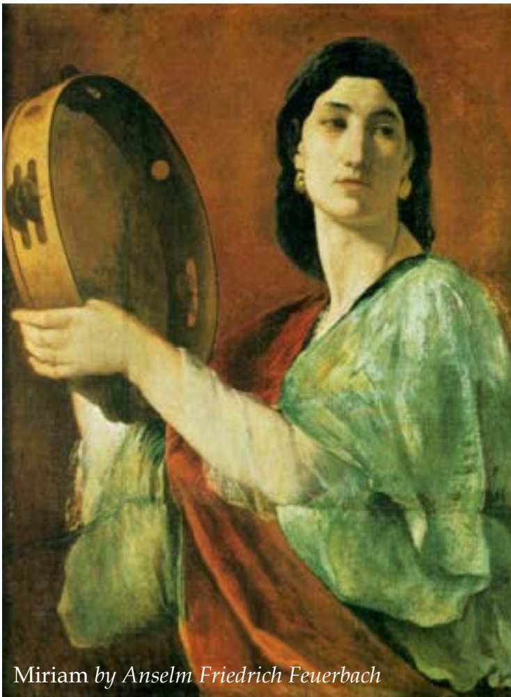
Miriam by Anselm Friedrich Feuerbach

The Old Testament is often seen as a history of Israel's beginnings, traced through the lives of the Patriarchs. But the Patriarchs could not have accomplished their work without partnerships with the Matriarchs, women who also heard God's voice, received God's promises, and played essential roles in the salvation story. In this four-week series, we will explore the lives of some of the Matriarchs who helped to shape the People of God.