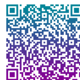
Amazon Wish List

Please Note: Donations should be dropped off by Tuesday 1:00pm. Facing Homelessness is not a food bank, so donations of things like pasta/canned tomatoes/beans/etc. are encouraged to donate to St. Francis House. There are additional instructions in the signup link. Thank you!