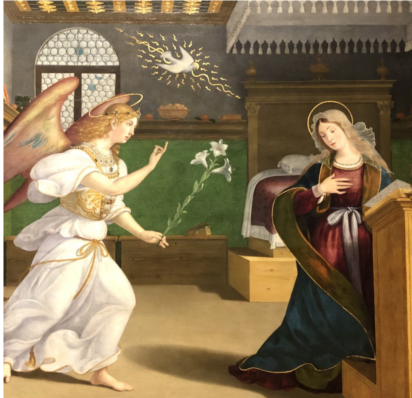
Andria Previtali ca 1520-1525 collection of Memphis Brooks Museum of Art