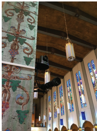
The new PTZ cameras, expertly installed by our fantastic Facilities crew

The church YouTube account has over 1,700 subscribers (if you haven't subscribed, do it today!), so we are able to broadcast live at 5pm on Saturday night. Once the Mass is recorded on Saturday evening, the video and sound still needs to be optimized for re-uploading, which takes hours, and a high degree of technical knowledge. Once it's up, everyone is able to watch it at any time – the Mass, coming home to you.